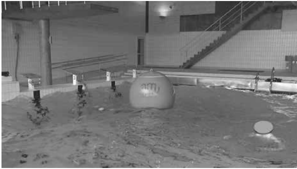
Figure 1 — Setup of wave-making ball.

200 m time trial. During testing, the swimmers were asked to swim 200 m breaststroke as fast as they could, but not with maximal speed at the start to minimize the effect of “a too fast start and inability to finish” for those swimmers who were less accustomed to this distance. They were instructed to prioritize finishing the distance while swimming as fast as they could for the entire 200 m. All swims were timed using a video camera (Sony HDR CX730E, Sony Inc., Japan) with a time-code overlaid on the recording. In addition to the 200 m finish time, lap times for each 50 m lap were recorded, as well as the time required to complete each turn at 50 m, 100 m, and 150 m, recorded as the time between the hand-touch and the toe-off from the turning wall.