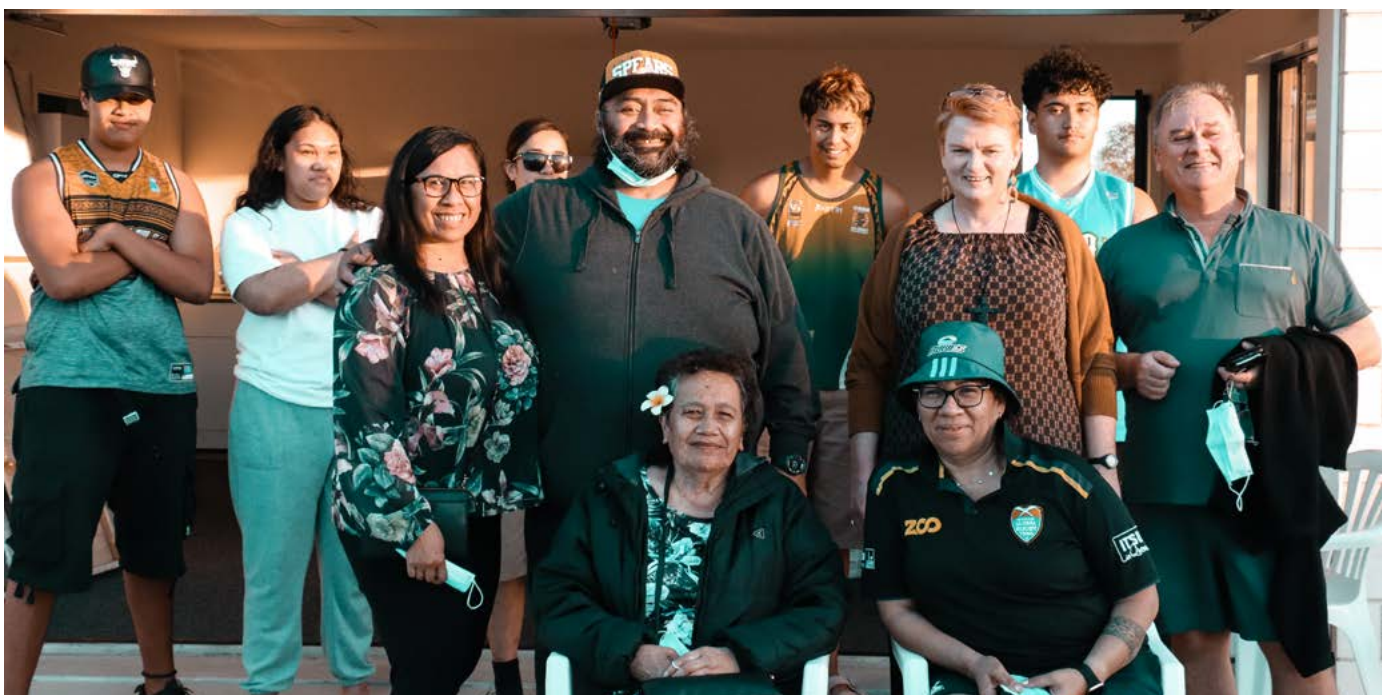
Moving-in day: The extended MacArthur whānau gather to bless and open their new home.