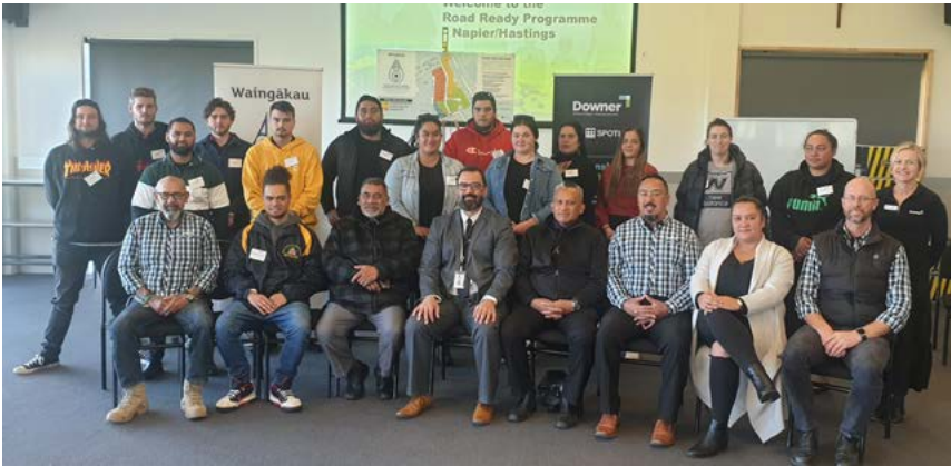
14 people graduated from the Road-Ready pre-employment programme.