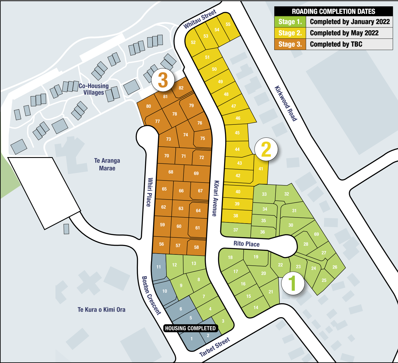
Te Haaro o Te Kaahu: Overall view of the 12.7ha Waingākau site, with civil roading works scheduled for completion over three stages.

In late 2020, the Provincial Development Unit believed in our vision and supported with significant funding. Combined with the support of Hastings District Council , we were able to select engineers, finalise plans and appoint contractors. In April this year, we started civil construction and we are delighted with the progress across the entire supply chain of workers. Everybody understands that we are not just building beautiful roads and houses, we are building a nurturing community.