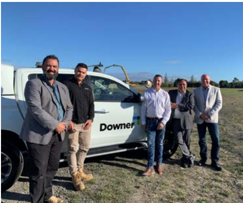
Downer NZ appointed by TToH to build the roads.