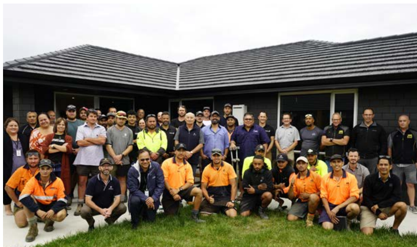
Ngā mihi: Thank you BBQ hosted to celebrate the completion of the first six homes.