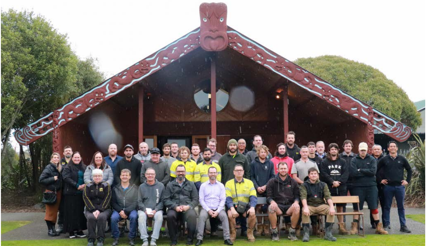
Kaihanga Whare (Building Teams): Waingākau team mihi to the Builders with pōwhiri, whanaungatanga, kōrero, and kai under the beautiful embrace of Te Aranga Marae.

We continue to look for opportunities to support Māori business and individuals as the Project progresses.