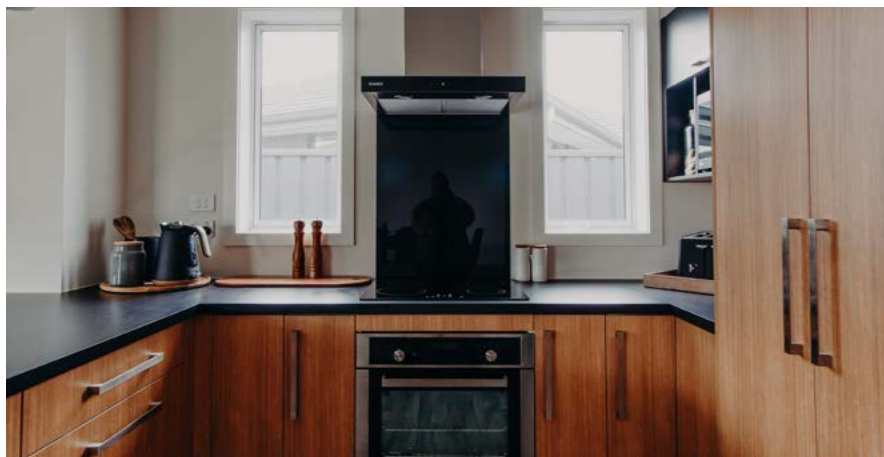
Obtainable Homes: Whānau Māori are supported to obtain a warm, dry, healthy and efficient home through Pathways to Homeownership / Shared Equity and also a $20k TToH contribution.