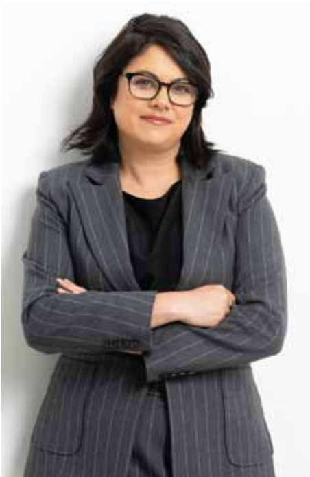
Dr Ayesha Verrall