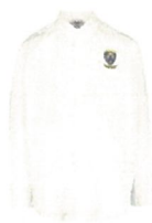
Schooltex Porirua College Long Sleeve Shirt With Embroidery