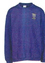
Schooltex Porirua College Sweatshirt With Embroidery