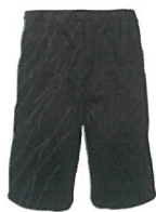
Schooltex School Summer Shorts