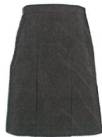
Schooltex Inverted Pleat Skirt