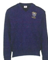
Schooltex Porirua College Jersey With Embroidery