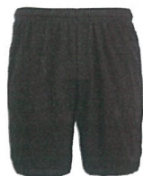
Schooltex Sport Shorts