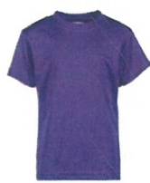
Schooltex Kids' Plain Breezeway Tee