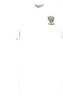
Schooltex Porirua College Short Sleeve Polo With Embroidery