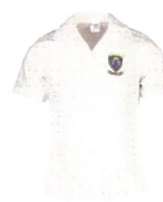
Schooltex Porirua College Short Sleeve Blouse