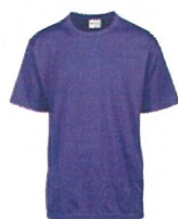
Schooltex Adults' Plain Breezeway Tee