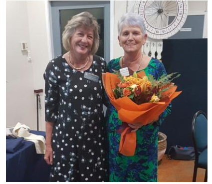
A Fantastic evening of fun and friendship with great food and wine