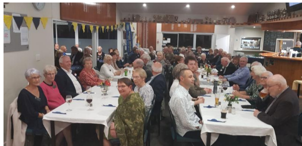
and Fabulous entertainment