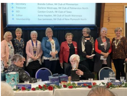
New District Committee