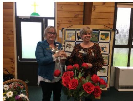
Candlestick Award for most new members