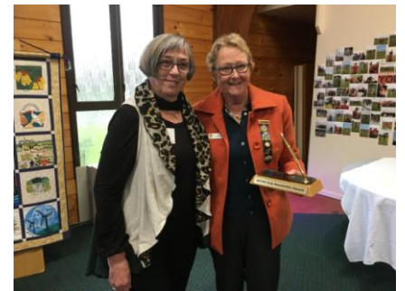
Award for Best Newsletter