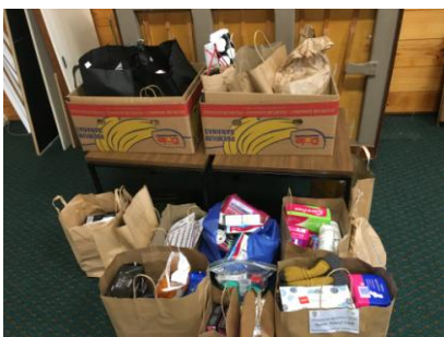
Goods we donated to the Mission