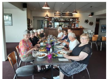
Balclutha and Mosgiel