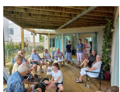
Orewa and Whangaporoa