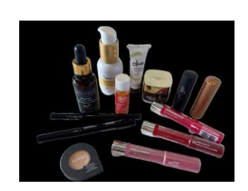
Examples of lucky dip goodies.

For every $20 you donate we have a cracker as a special gift for you, as our way of saying thank you