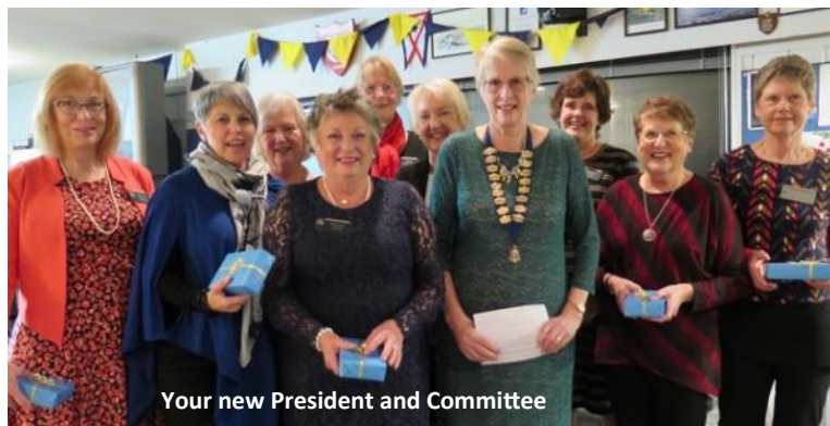
Your new President and Committee