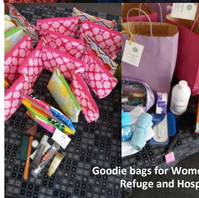
Goodie bags for Women's Refuge and Hospital