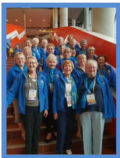
23 Members of NZ294