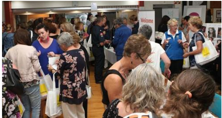
Photo Right shows the “busyness” of the evening. Members, family members, friends and members from other IW Clubs attended