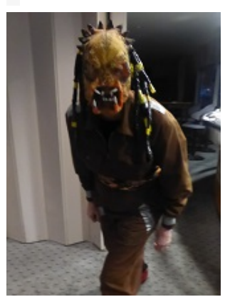
I have nothing to say!!!!