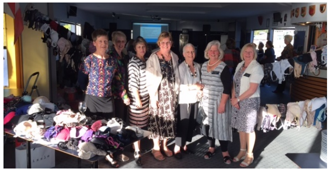
I must say the assortment of style and size was a sight to see!

Our evening at the Zonta meeting on 6 November where we presented the bras and knickers went extremely well. Zonta were very appreciative of the efforts we had gone to.