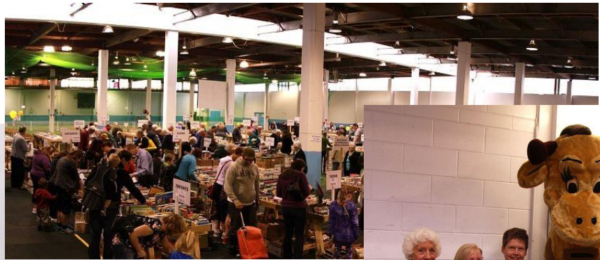
A very successful weekend