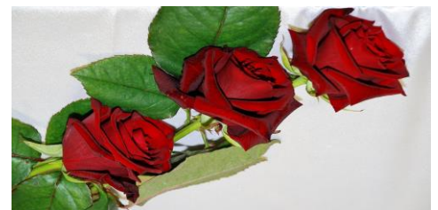
Yours in friendship Adrienne