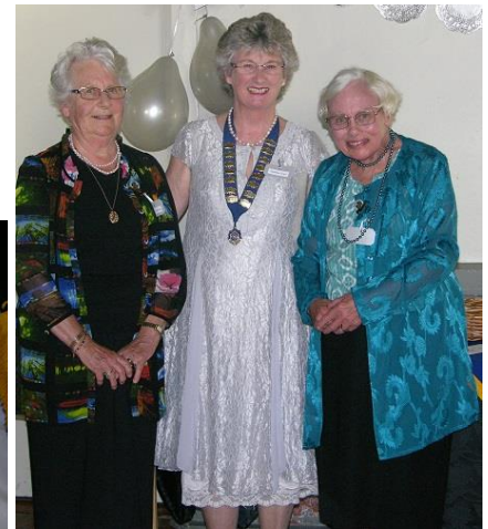
Honoured active members