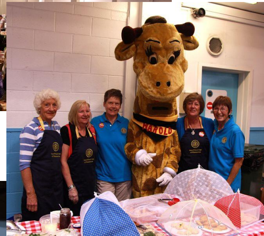
What are they up to??