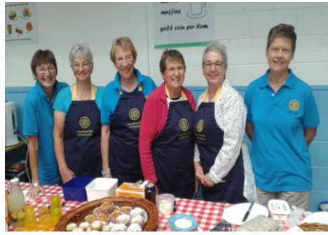
The team on Saturday morning – when it all began