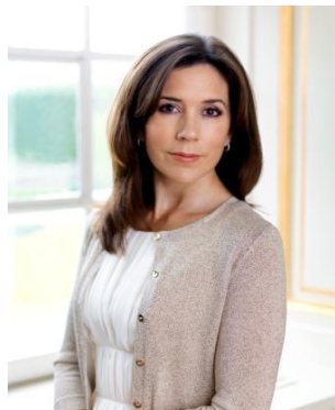
Patron of the 16 th International Inner Wheel Convention Her Royal Highness - The Crown Princess Mary

Her Royal Highness The Crown Princess Mary has made us the great pleasure and honour to be the patron of the 16 th International Inner Wheel Convention in Copenhagen. HRH The Crown Princess is very socially engaged and has undertaken a wide range of patronages, many of them related to children and women, which is in line with the international project 2012-2015 of International Inner Wheel and the values of our organisation