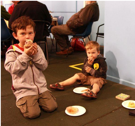
Proof that the food was enjoyed! Above and below