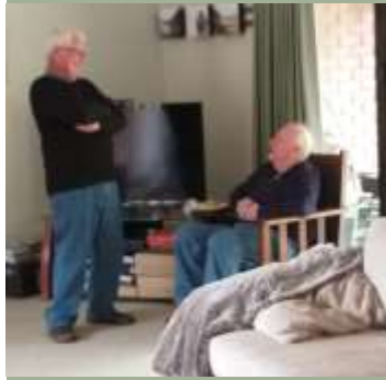
Kapiti and Wairarapa Clubs joined us at Pauatahanui Church