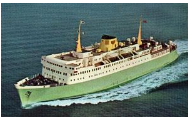
Aramoana some years ago