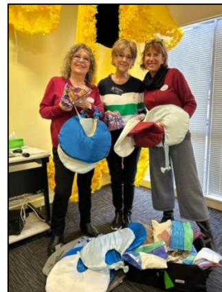
TABLE FOR 8