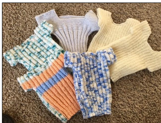
knitting and sewing from our wonderful ladies