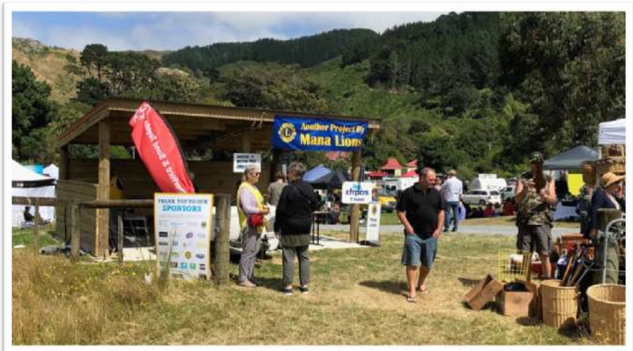
EAT DRINK and BE CRAFTY FAIR - BATTLE HILL 2019