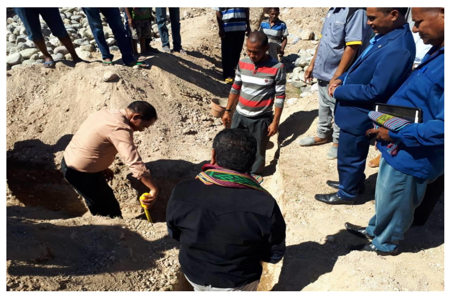
After the checking they started laying the stones.