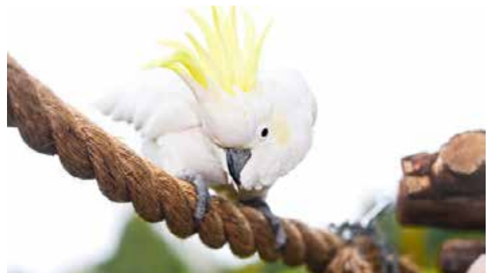
Charlie at Brooklands Zoo