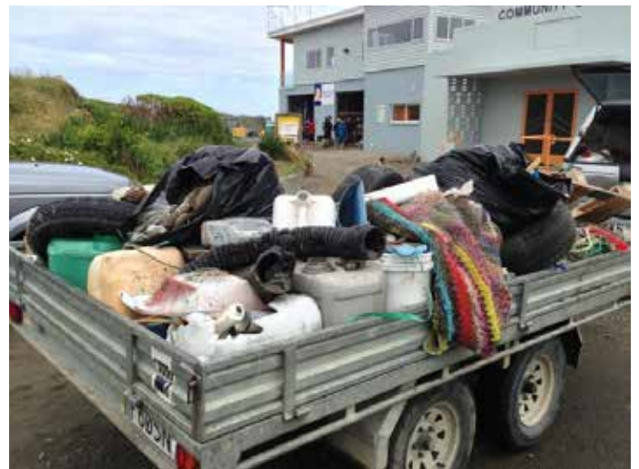
Himatangi Beach Cleanup.