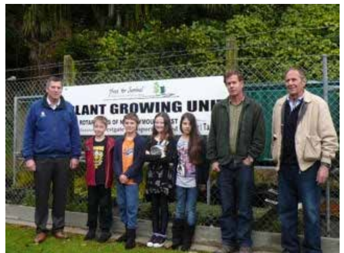
Trees for Survival Project.