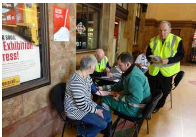
Blood Pressure Check