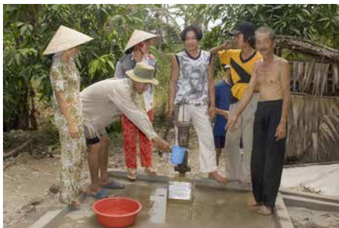
Completed water well in Vietnam