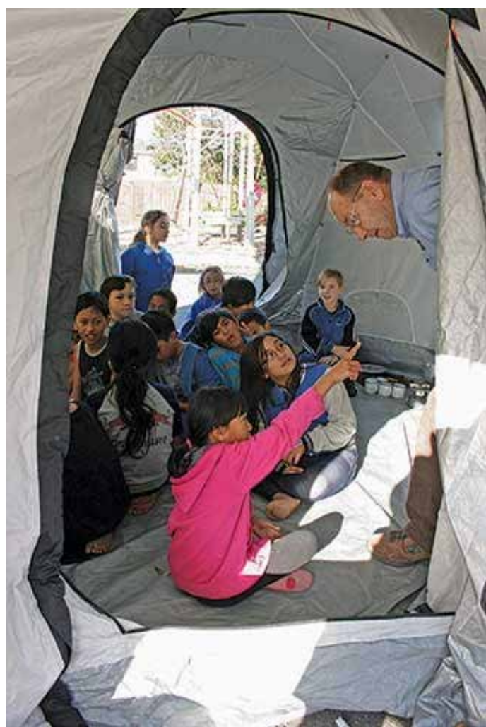
Otaki School's Room 1 pupils inside the Shelter Box tent where they were shown the contents

for St Johns Ambulance at their annual Blood Pressure Check.