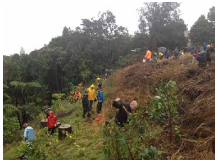
New Plymouth West Rotary helps out Oakura School.