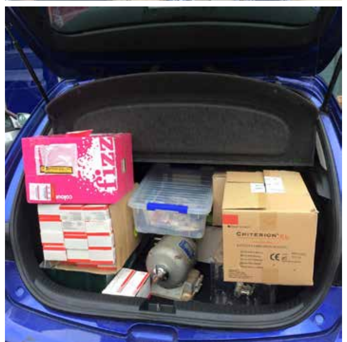
First pick up of unwanted dental instruments/equipment in support of the Marine Reach Pacific Hope outreach this year.