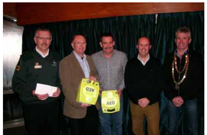
Presentation of defibrillators to St Johns Ambulance, Arohanui Hospice, and Himatangi Surf Life Saving Club.