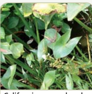
Californian arrowhead Sagittaria montevidensis

Max height: 10 metres. Impact: Smothers plants in native ecosystems suppressing growth and regeneration.