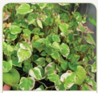
Houttuynia Houttuynia cordata

Marginal aquatic (freshwater) Identify: Glossy leaves. Flowers have three large white petals with purple blotch at base. Max height: 1 metre. Impact: Suppresses native wetland plants. Blocks watercourses and drains.