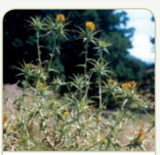
Saffron thistle Carthamus lanatus

(Herb) Identify: Heartshaped leaves with sharptoothed edges. Covered with stinging hairs. Max height: 1.5 metres. Impact: Unpalatable to livestock, reducing grazing area.