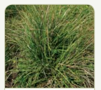
Australian sedge Carex longebrachiata

(Herb) Identify: Zigzagshaped stems attached to hollow purple-speckled stalks. White drooping. flowers. Dies down in winter. Max height: 3 metres. Impact: Shades and crowds all other native plants.