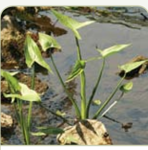
Hawaiian arrowhead Sagittaria sagittifolia

(Herb) Identify: Zigzagshaped stems attached to hollow purple-speckled stalks. White drooping flowers. Dies down in winter. Max height: 4 metres Impact: Forms dense stands, shading and crowding other vegetation.