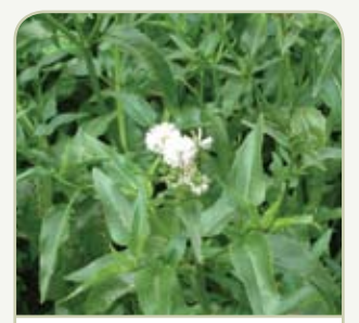
Senegal tea Gymnocoronis spilanthoides

(Herb) Identify: Squareshaped stems. Max height: 3 metres. Impact: Suppresses native wetland plants. Blocks watercourses and drains.