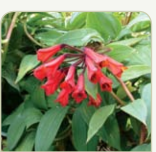
Bomarea Bomarea caldasii, B.multiflora

(Grass) Identify: Long arching leaves, Y-shaped in cross section. Long branching seedheads. Max height: 1 metre. Impact: Competes with pasture species, reducing livestock grazing area.