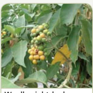
Woolly nightshade Solanum mauritianum

(Thistle) Identify: Covered in sharp spines. Max height: 1 metre. Impact: Competes with pasture species, reducing livestock grazing area.