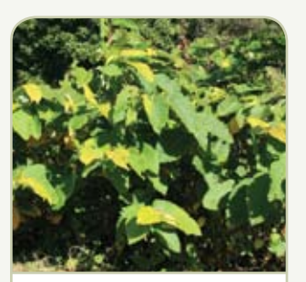
Giant knotweed Reynoutria sachalinensis and hybrids

(Herb) Identify: Zigzagshaped stems attached to hollow purple-speckled stalks. White drooping flowers. Dies down in winter. Max height: 4 metres Impact: Forms dense stands, shading and crowding other vegetation.