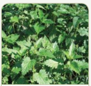
Perennial nettle Urtica dioica and subspp

(Vine) Identify: Exudes white sticky sap. May be seedlings beneath plant. Max height: 6 metres. Impact: Smothers native plants, suppressing growth and regeneration. Some people are allergic to sap.