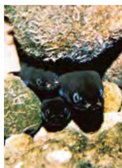
Banded kokopu (left) and eels (right)