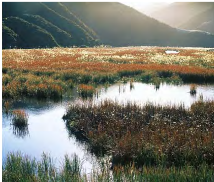
Lake Kohangatera, Pencarrow

Wetlands occur in areas where surface water collects or where underground water seeps through to the surface. They include swamps, bogs, salt marshes, lakes and some river edges.