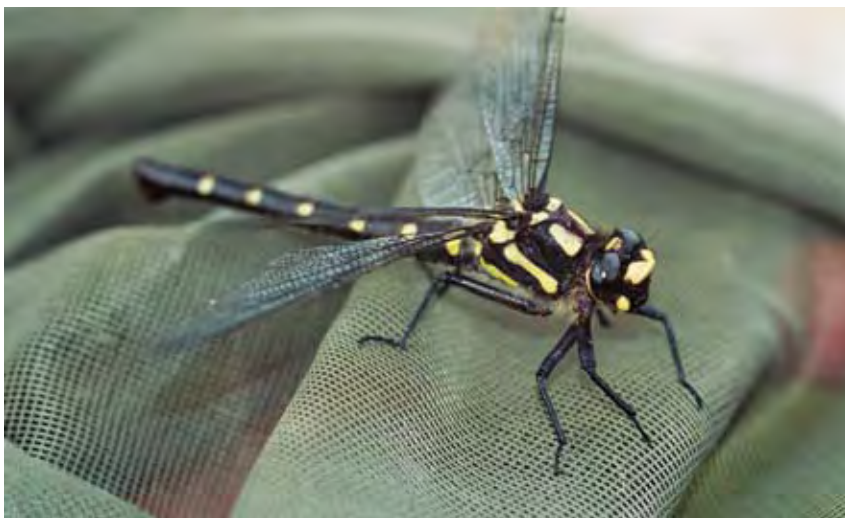
Large native dragonfly

Indeed, most of New Zealand's wetland animals are not found anywhere else in the world. They include fernbirds, New Zealand dabchicks and scaup, shoveler, and paradise shelducks. Mudfish are also unique.