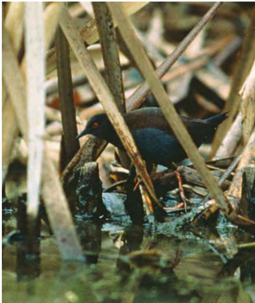
Spotless crane among raupo

The bigger and more diverse your wetland and those in your area, the more diverse your birdlife will be. The table on the following page shows the kinds of habitat wetland birds need.