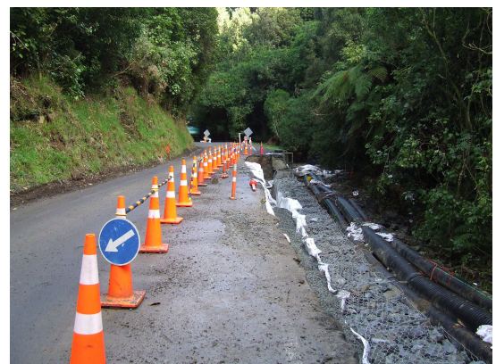
Work in progress at Site 1