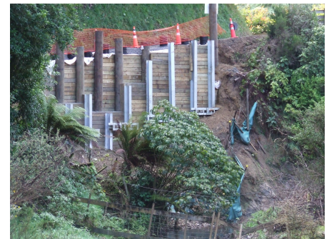
Site 815 – Before & after