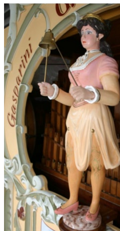
Photo: Draaiorgel 'De Lieve Stem', a 19th Century Museum Piece

This unique complex will host the Dutch Connection, a Maori arts centre, a Flax museum, a library, an i-SITE visitor information centre, a café, and much more. You'll love coming for a visit, en een lekker kopje koffie!