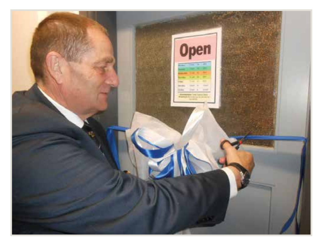
Hon. Chester Burrows MP for Whanganui opening the Whanganui Multicultural Council's office "One Stop Shop" to support migrants and refugees.

Providing services to new migrants is a core function of multicultural councils. A number of local councils are members of the New Zealand Newcomers Network, operate local networks and employ a migrant services or newcomers network co-ordinator. Activities include social lunches, morning teas, potluck dinners, walking groups, pre-school playgroups, marae visits, settlement and employment support and educational activities. A number of councils have received funding from the Office of Ethnic Communities Settling In Fund, which has also made a grant to Multicultural New Zealand towards developing a national network of migrant centres. Multicultural Councils also regularly attend mayoral citizenship ceremonies for migrants taking up New Zealand citizenship.