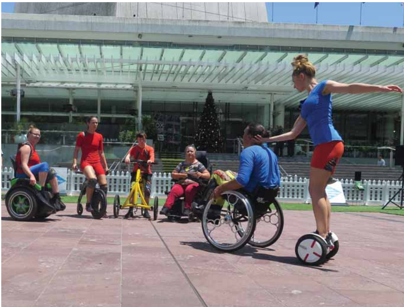
Auckland dance company Touch Compass performs Somatechnics in December 2017 to lunchtime audiences in Auckland's Aotea Square