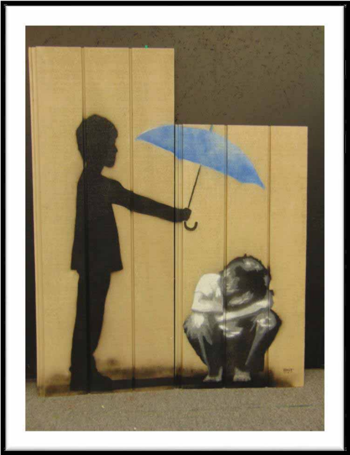
This painting, called Imaginary Friend , was one of the works featured in Habitat for Humanity – The Power of Shelter charitable exhibition and art auction at Whangarei Art Museum in October 2017. The artist is a prisoner in Northland Region Corrections Facility and has been participating in its arts programme part-time for four years and fulltime over the past two years. He has contributed work for murals in the Facility's youth unit and gifted many pieces of work for charitable causes, including Imaginary Friend , which sold for $5200. He is about to complete an NCEA qualification, Level 4 Art.