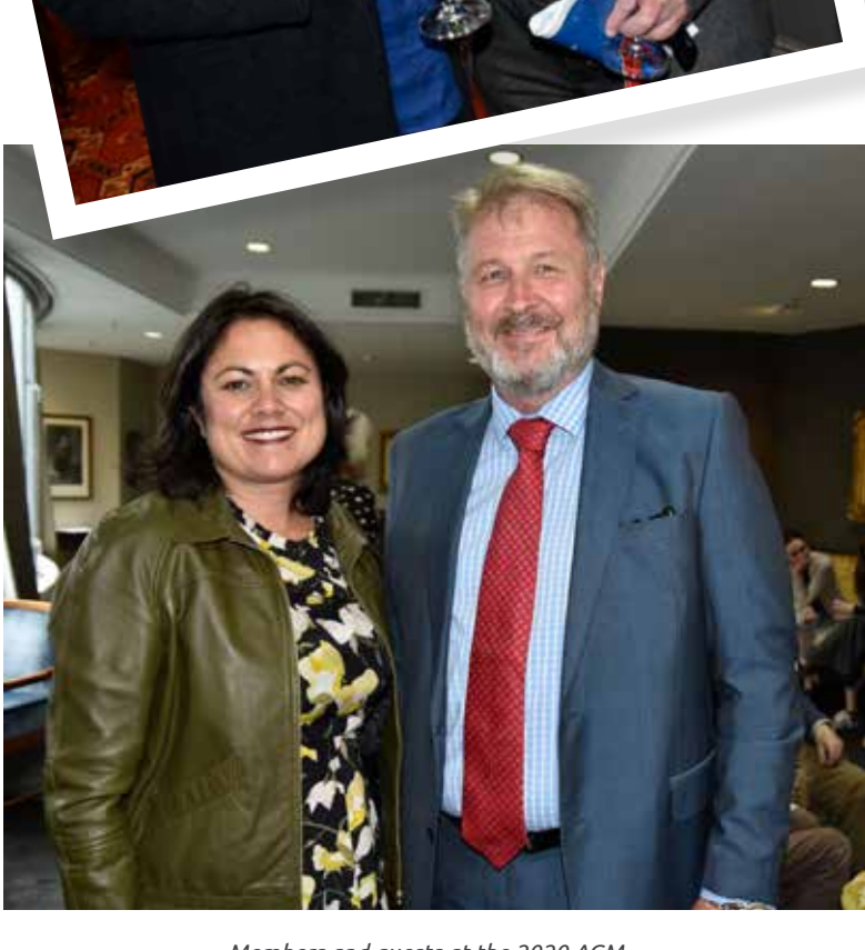
Members and guests at the 2020 AGM